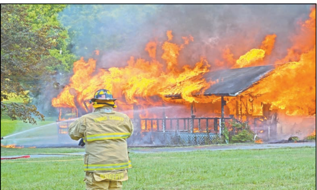
The Towns County Fire Department arrived within three minutes to put water to flame at this home on Bell Street. No one was seriously injured as a result of the fire, but the home did not survive the intense blaze.